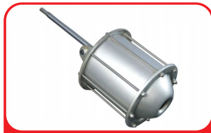
Optional single intake cylinder