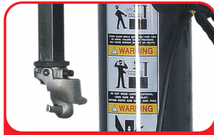
Stainless steel working head