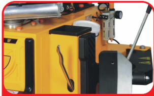
Enhanced bead breaker arm