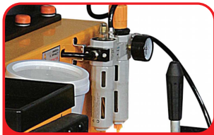
Oil-water separator for exporting